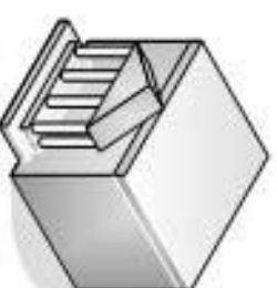
Bank des Kreditors